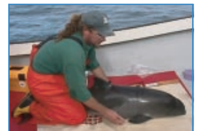
Sitting position