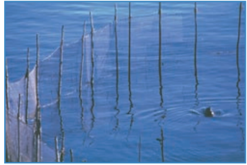
Porpoise in weir