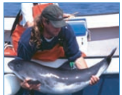
Porpoise release © Scott Taylor

Grand Manan Whale and Seabird Research Station - http://www3.nbnet.nb.ca/gmwhale/